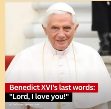
Pope Emeritus Benedict XVI 1927 – 2022