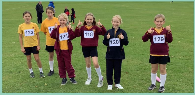
Schools competitions are back: well done representing St Louis