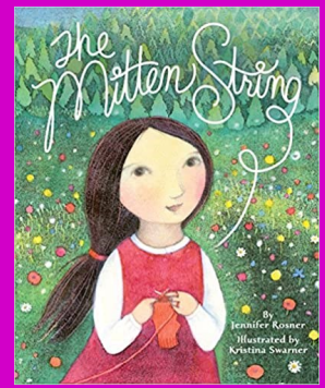
https:// childrensbookproject.co.uk/ Helping all children to enjoy books